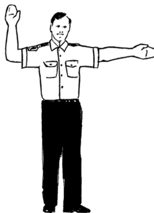
figure 1(e) combination from front and rear