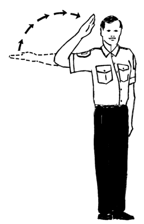
figure 2(a) from left side