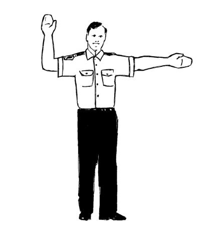
figure 1(d) from right side