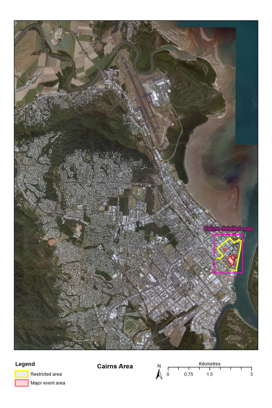
Page 14 2018 SL No. 27 Authorised by the Parliamentary Counsel