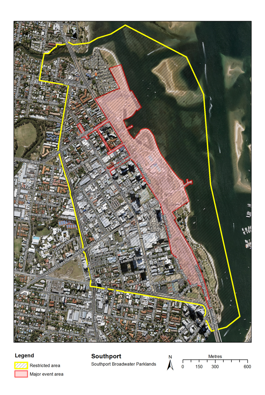
Page 10 2018 SL No. 27