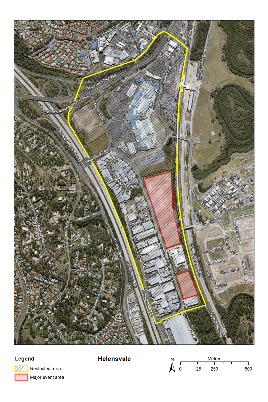
Page 8 2018 SL No. 27