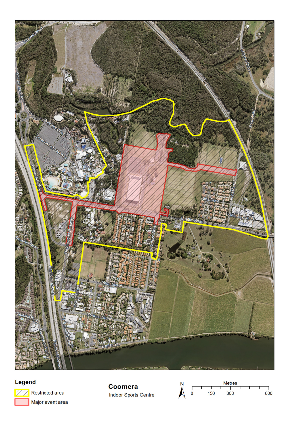
Page 6 2018 SL No. 27