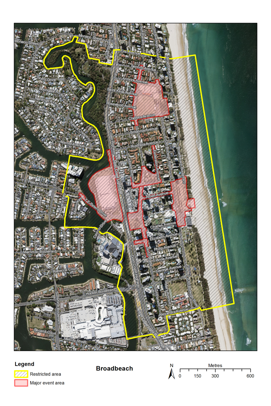
Page 12 2018 SL No. 27