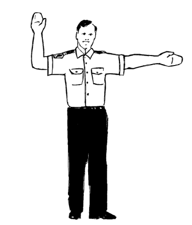
figure 1(d) from right side