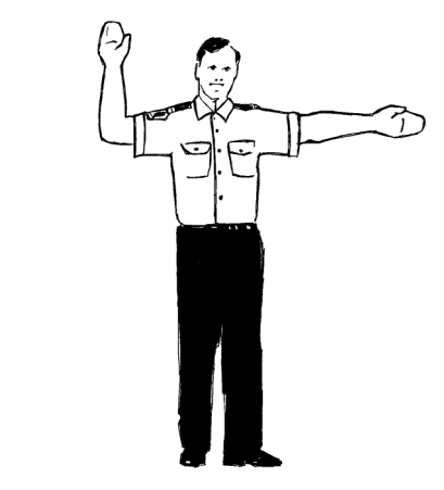
figure 1(d) from right side