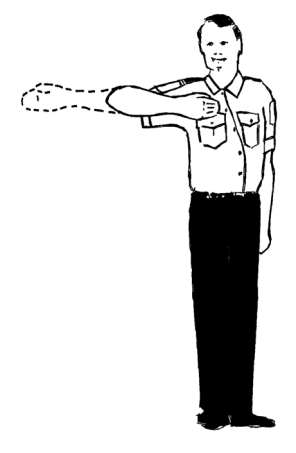
figure 2(b) from right side