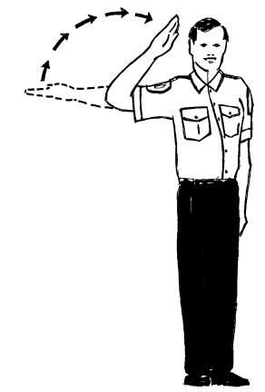
figure 2(c) from right side