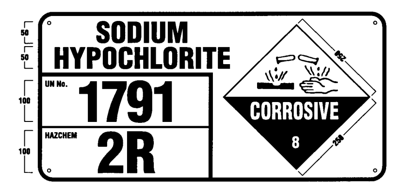
figure 4—example of completed emergency information sign for single class of hazardous substance