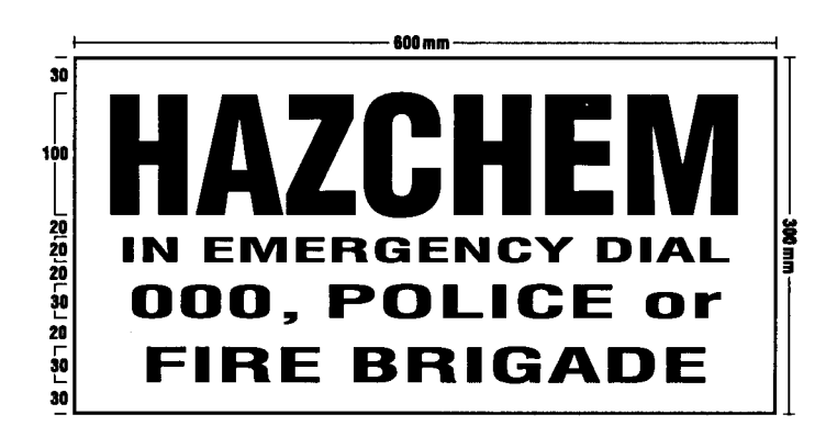
figure 2—outer warning sign