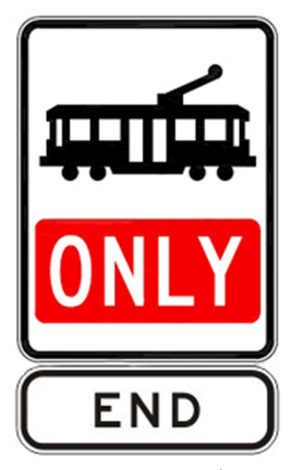
End tramway sign