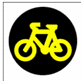
Yellow bicycle crossing light