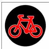
Red bicycle crossing light