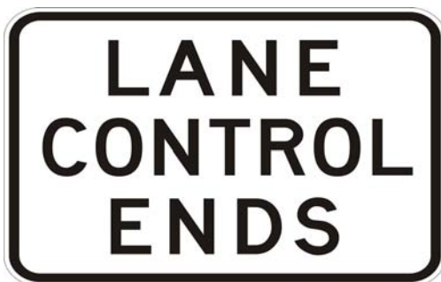
Lane control ends sign’.