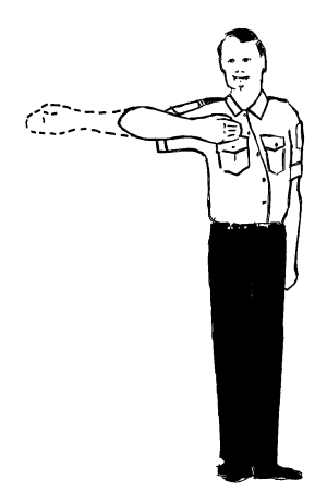
figure 2(b) from right side