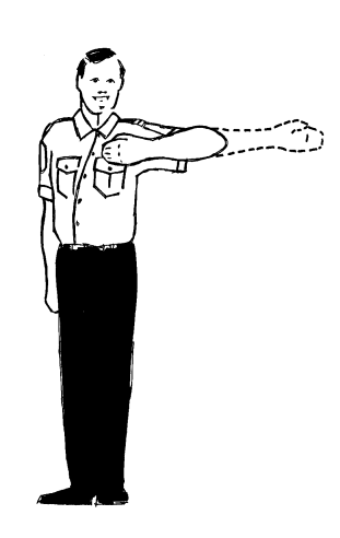
figure 2(a) from left side