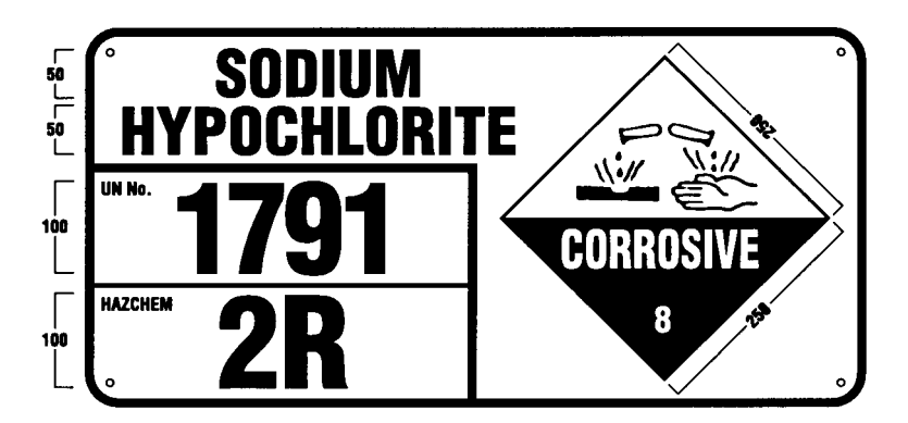
figure 4—example of completed emergency information sign for single class of hazardous substance