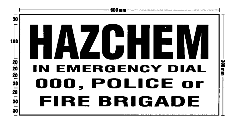
figure 2—outer warning sign