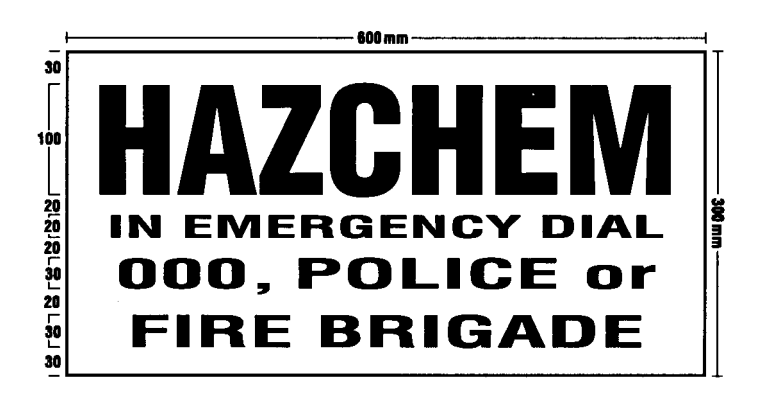
figure 2—outer warning sign