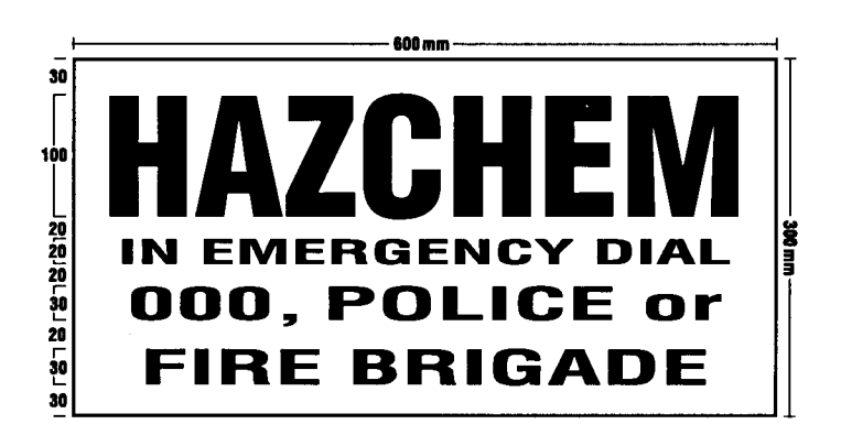
figure 2—outer warning sign