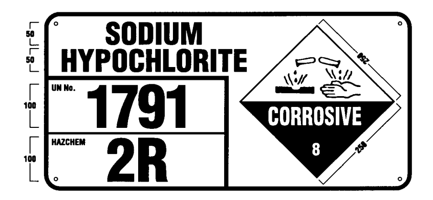
figure 4—example of completed emergency information sign for single class of hazardous substance

(4) Particular to be displayed on emergency information sign at a place where multiple classes of hazardous substances are stored—