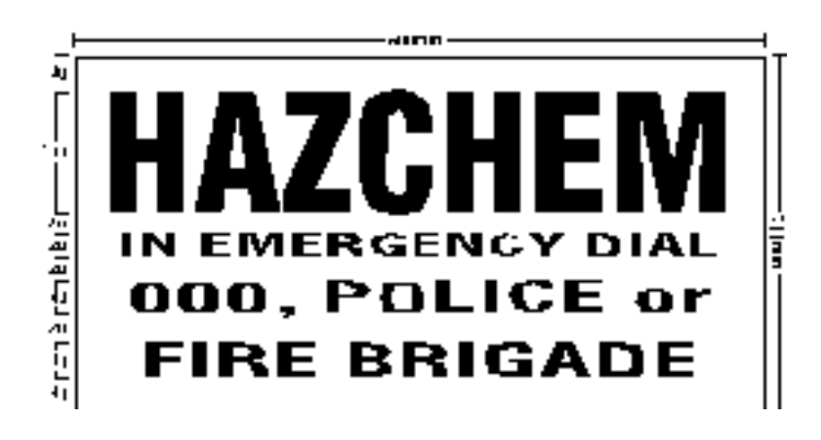
figure 2—outer warning sign