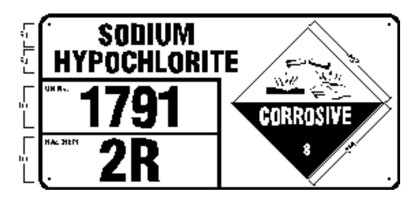
figure 4—example of completed emergency information sign for single class of hazardous substance