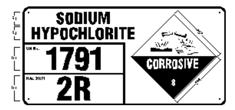
figure 4—example of completed emergency information sign for single class of hazardous substance

(4) Particular to be displayed on emergency information sign at a place where multiple classes of hazardous substances are stored—