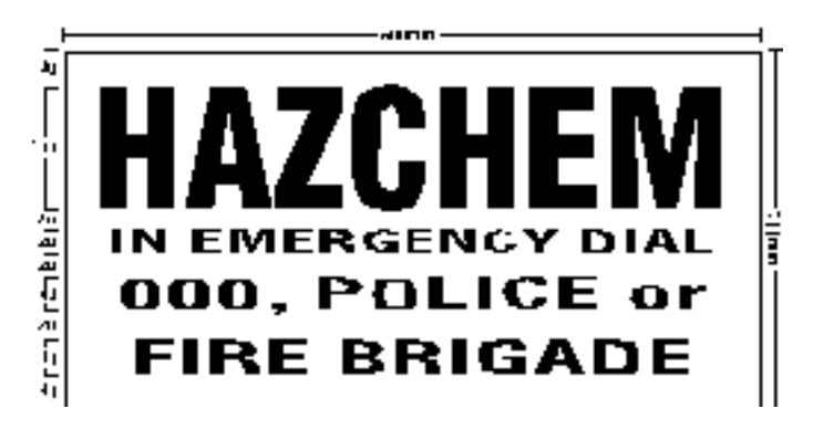
figure 2—outer warning sign

(3) The sign shall have red sans serif capital letters and numerals on a white background.